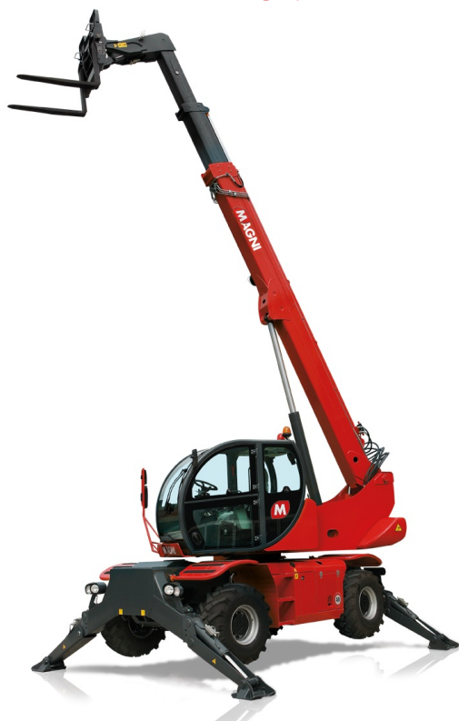
Load chart forklift with fork